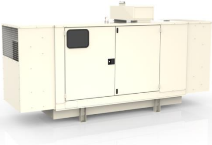
FP-300 Flat-Pack Canopy