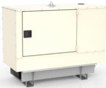
FP-030E Flat-Pack Canopy